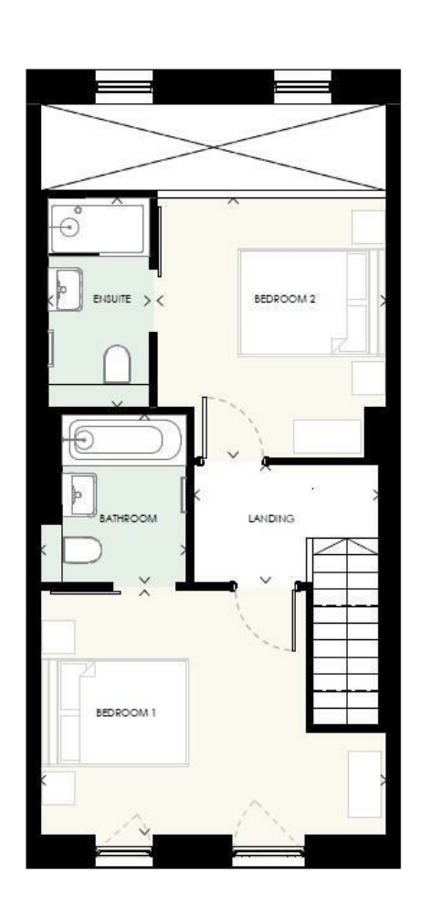
2 First Floor Plan