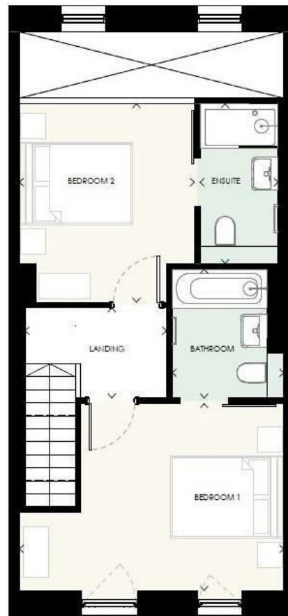
2 First Floor Plan 1:50