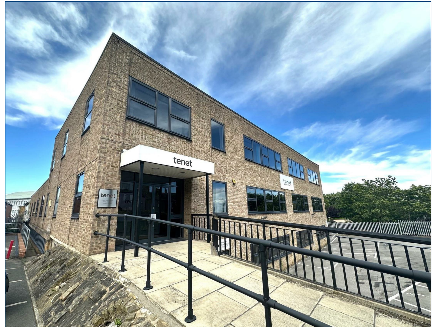
Network House, Lister Hill, Horsforth, LS18 5AZ