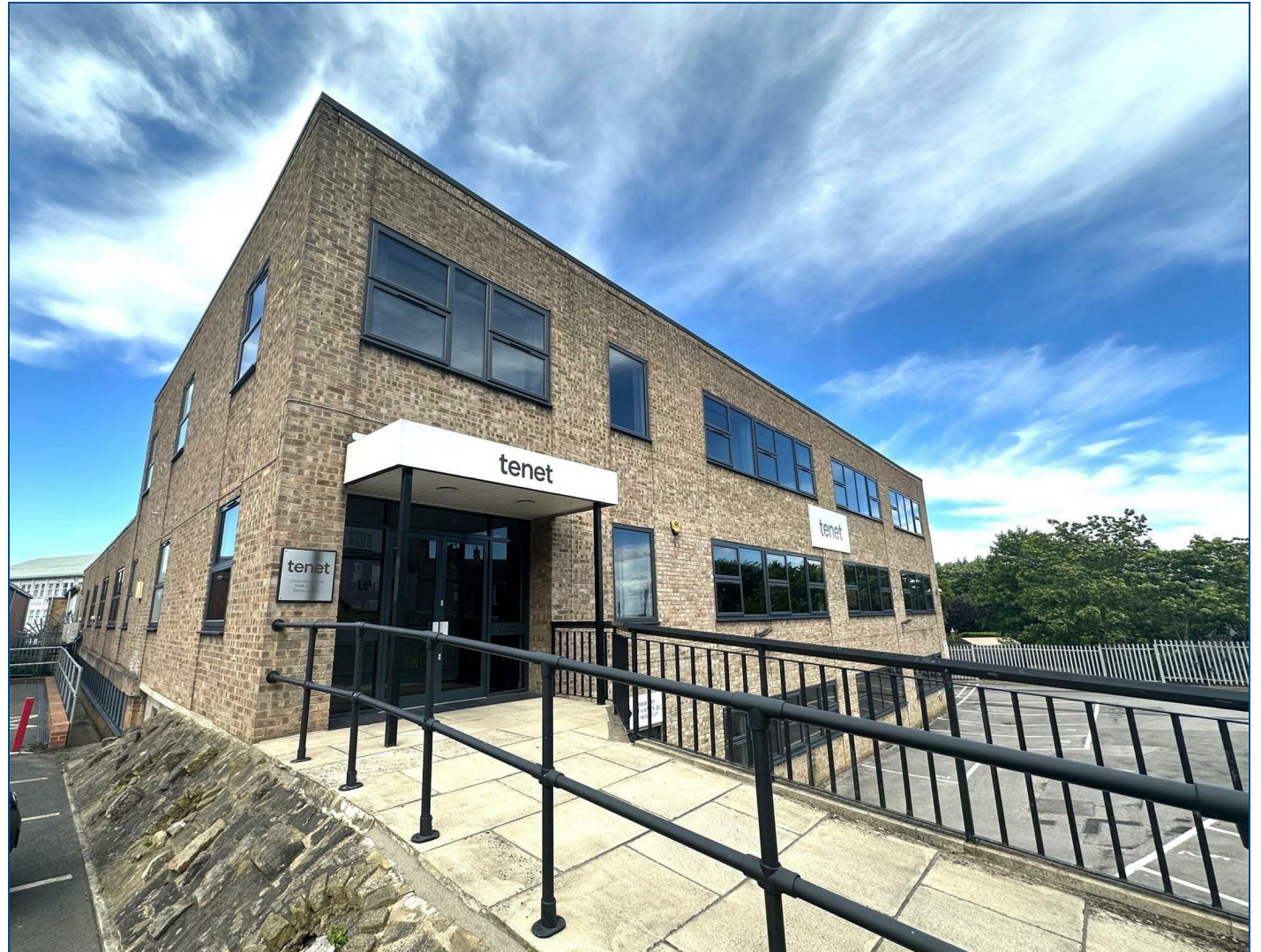
Network House, Lister Hill, Horsforth, LS18 5AZ