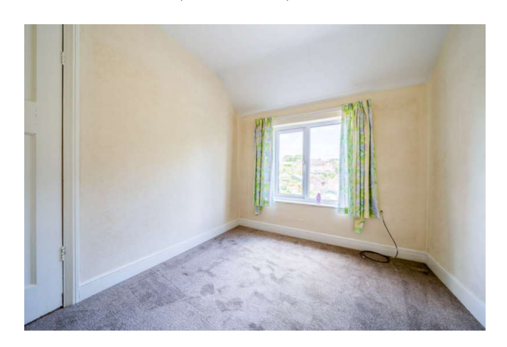
BEDROOM 2 (9'2" x 7'9")

Fitted carpet, range of fitted bedroom units with cream fronts of wardrobes with hanging rails and shelves, space for double bed with cabinets each side, shelf and cupboards over, side cupboard of hanging rail and shelves. Radiator, window to front.