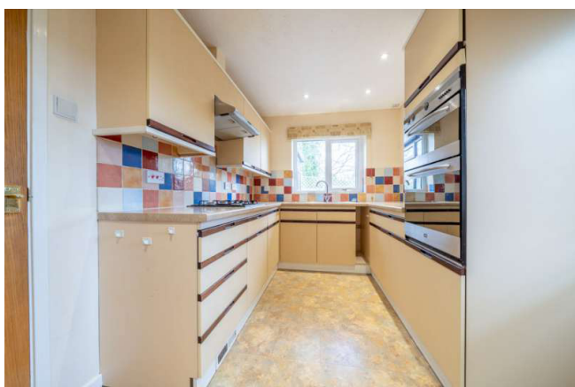
KITCHEN (13'6" x 7'8")

Range of base and wall units of cupboards and drawers, integral eye level double oven, space and plumbing for washing machine and other appliances, work surfaces with coloured tile splashbacks, inset stainless steel single drawer sink and swan neck mixer tap, inset four-ring gas hob with extractor over.