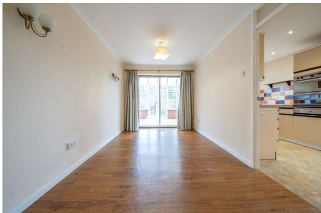
DINING ROOM (13'7" x 8'5")

Board style flooring, cornice, wall light fitting and sliding patio door to