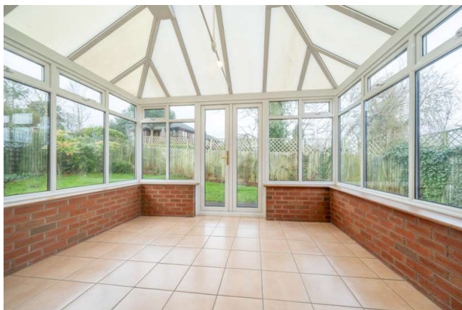
CONSERVATORY (11'1" x 9'0")

of uPVC double glazed frame on low brick walls with oblique box profile roof. Ceramic tile floor, French doors to the attractive rear garden, light and power points.