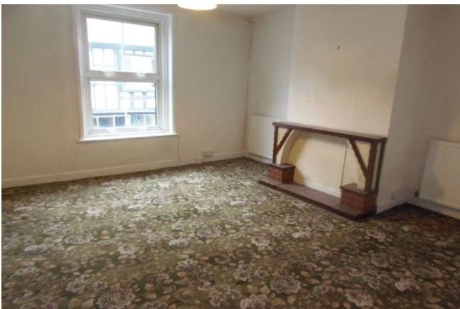
Fire surround, two radiators and window to High Street.