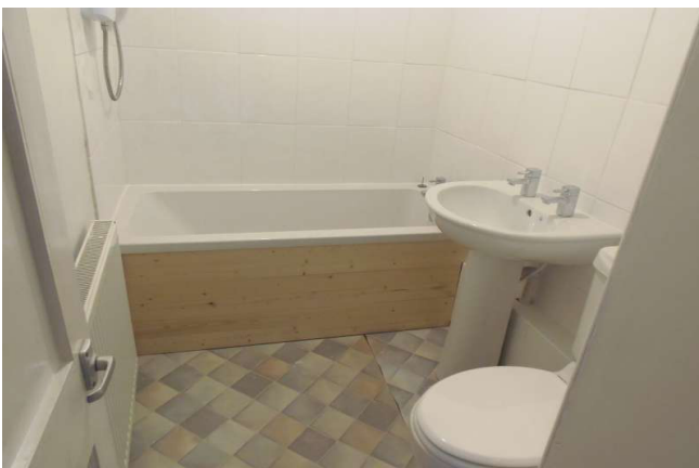
New white suite of panelled bath with mixer taps, Triton electric shower and tiling over, hand basin and WC. Part tiled walls, radiator and extractor fan.