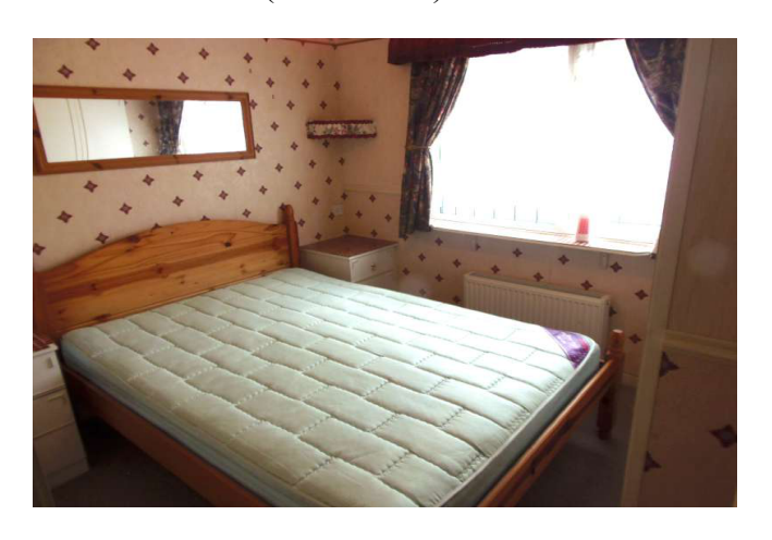
BEDROOM 2 (9'5" x 8'0")

Fitted carpet, radiator, dado rail, built-in wardrobe, two bedside tables, shelves, cornice, fan/light, window to side.