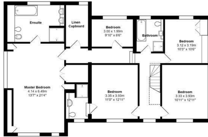
First Floor Area: 116.1 m 2 ... 1250 ft 2