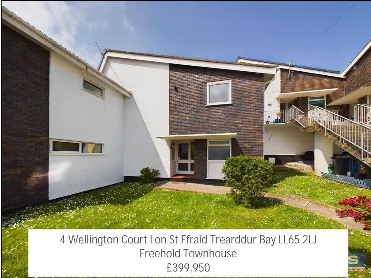
4 Wellington Court Lon St Ffraid Trearddur Bay LL65 2LJ Freehold Townhouse £399,950