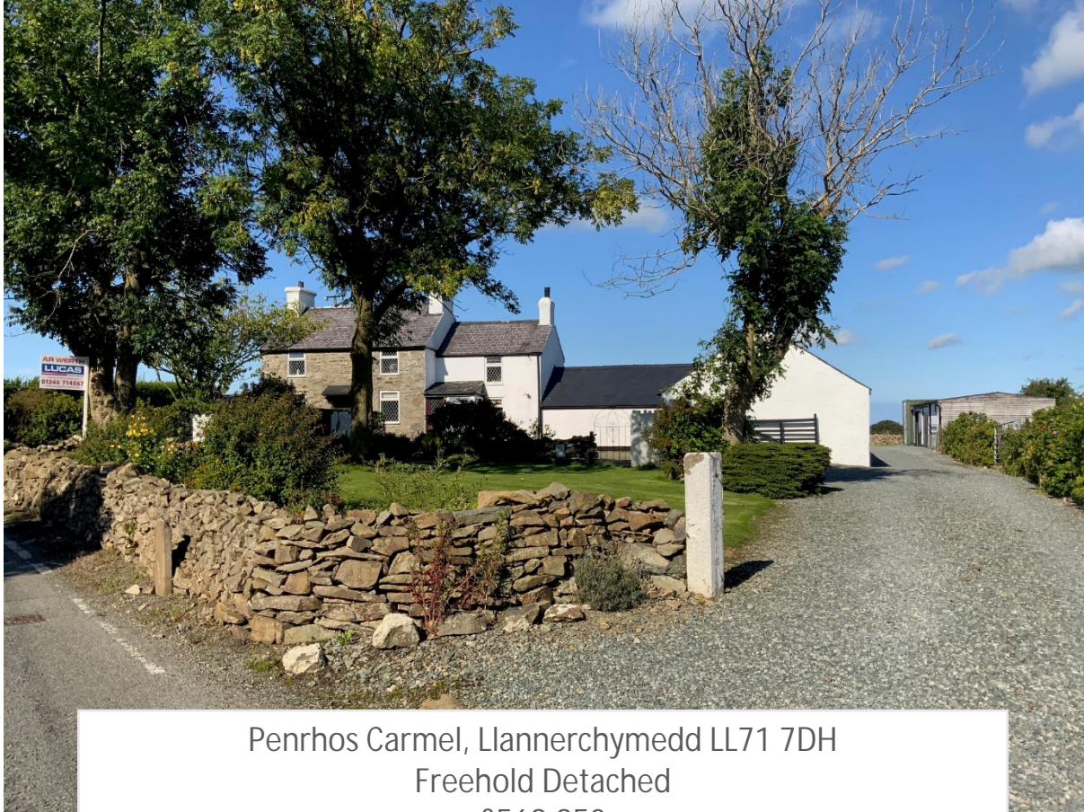
Penrhos Carmel, Llannerchymedd LL71 7DH Freehold Detached £569,950