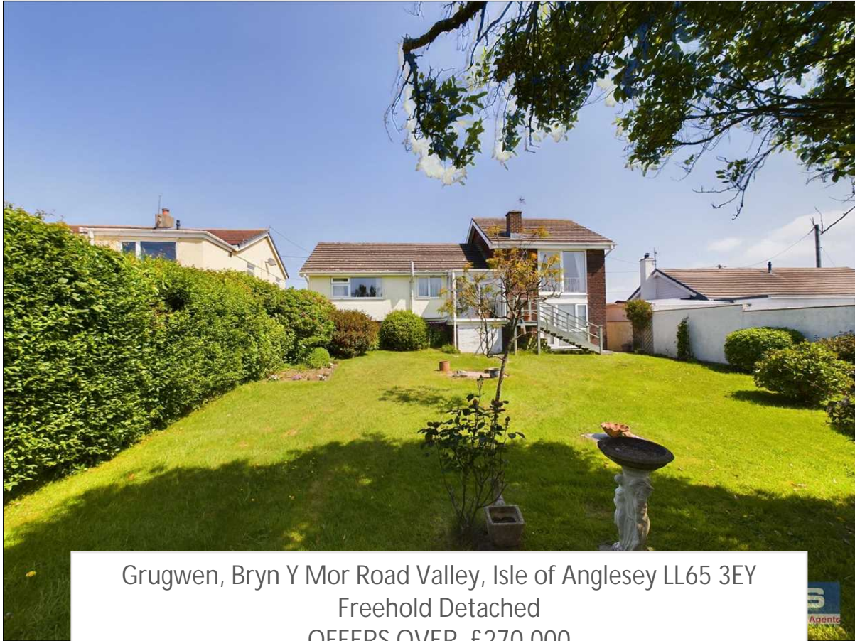
Grugwen, Bryn Y Mor Road Valley, Isle of Anglesey LL65 3EY Freehold Detached OFFERS OVER £270,000