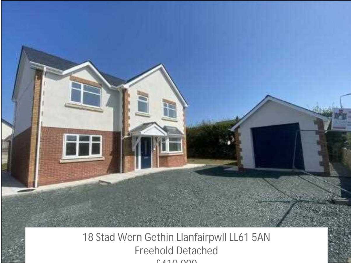
18 Stad Wern Gethin Llanfairpwll LL61 5AN Freehold Detached £410,000