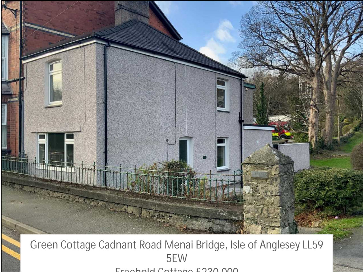
Green Cottage Cadnant Road Menai Bridge, Isle of Anglesey LL59 5EW Freehold Cottage £230,000