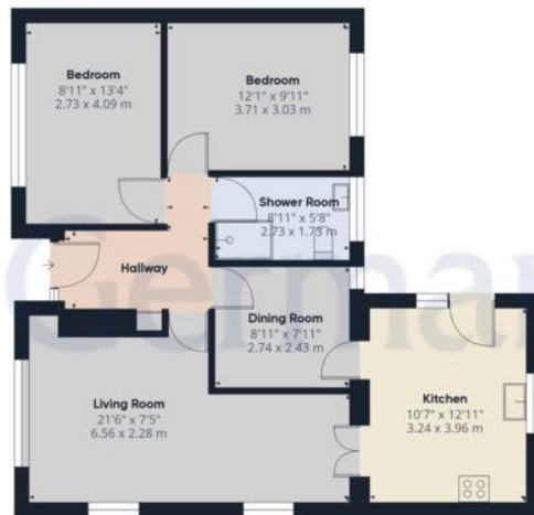
Ground Floor Building 1

The property information provided by John German Estate Agents Ltd is based on enquiries made of the vendor and from information available in the public domain. If there is any point on which you require further clarification, please contact the office and we will be pleased to check the information for you, particularly if contemplating travelling some distance to view the property. Please note if your enquiry is of a legal or structural nature, we advise you to seek advice from a qualified professional in their relevant field.