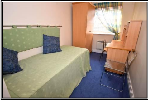
SECOND DOUBLE BEDROOM 13'10 x 6'6 (max) Double glazed window to front with electric radiator below.

SPACIOUS BATHROOM Partly tiled in decorative ceramics with suite comprising; pedestal wash hand basin, low flush w.c. and panelled bath with mixer tap and hand shower attachment. Coved ceiling, recess lighting, extractor fan, high level heater and shaver point.