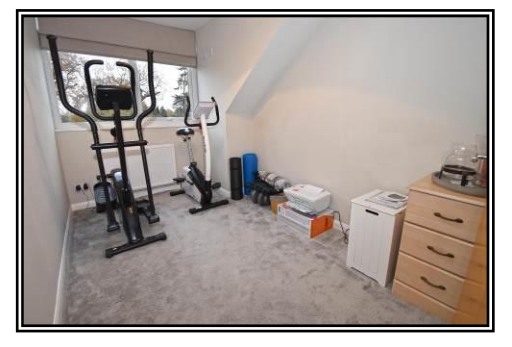
<u>BEDROOM FOUR</u> 11'5 x 7'2 Double glazed window to rear, again overlooking the garden and field beyond, and with thermostatically controlled radiator below.