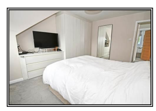
<u>BEDROOM TWO</u> 11'6 x 10'1 (to wardrobes) Double glazed window to rear overlooking the garden and fields beyond. Range of built-in wardrobes, thermostatically controlled radiator and TV point.