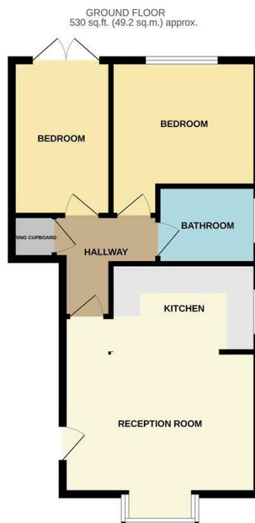
2 BEDROOM GROUND FLOOR

TOTAL FLOOR AREA - 530 sq.ft. (49.2 sq.m.) approx.