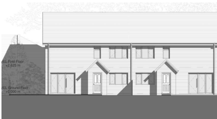
Front/North Elevation 1:100