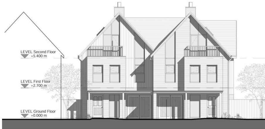
5 Front/East Elevation 1 : 100