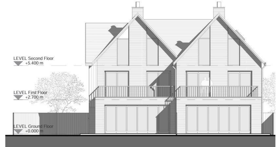
8 West/Rear Elevation 1 : 100