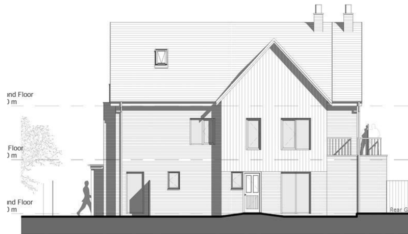
6 North/Side Elevation 1 : 100