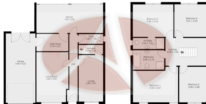
Ground Floor approx area- 116.0m2