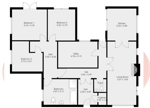
Lodge Abbey Road, WA10 6JX