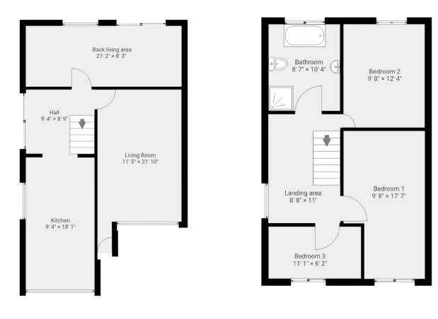
4 Croft Field, L31 6AB