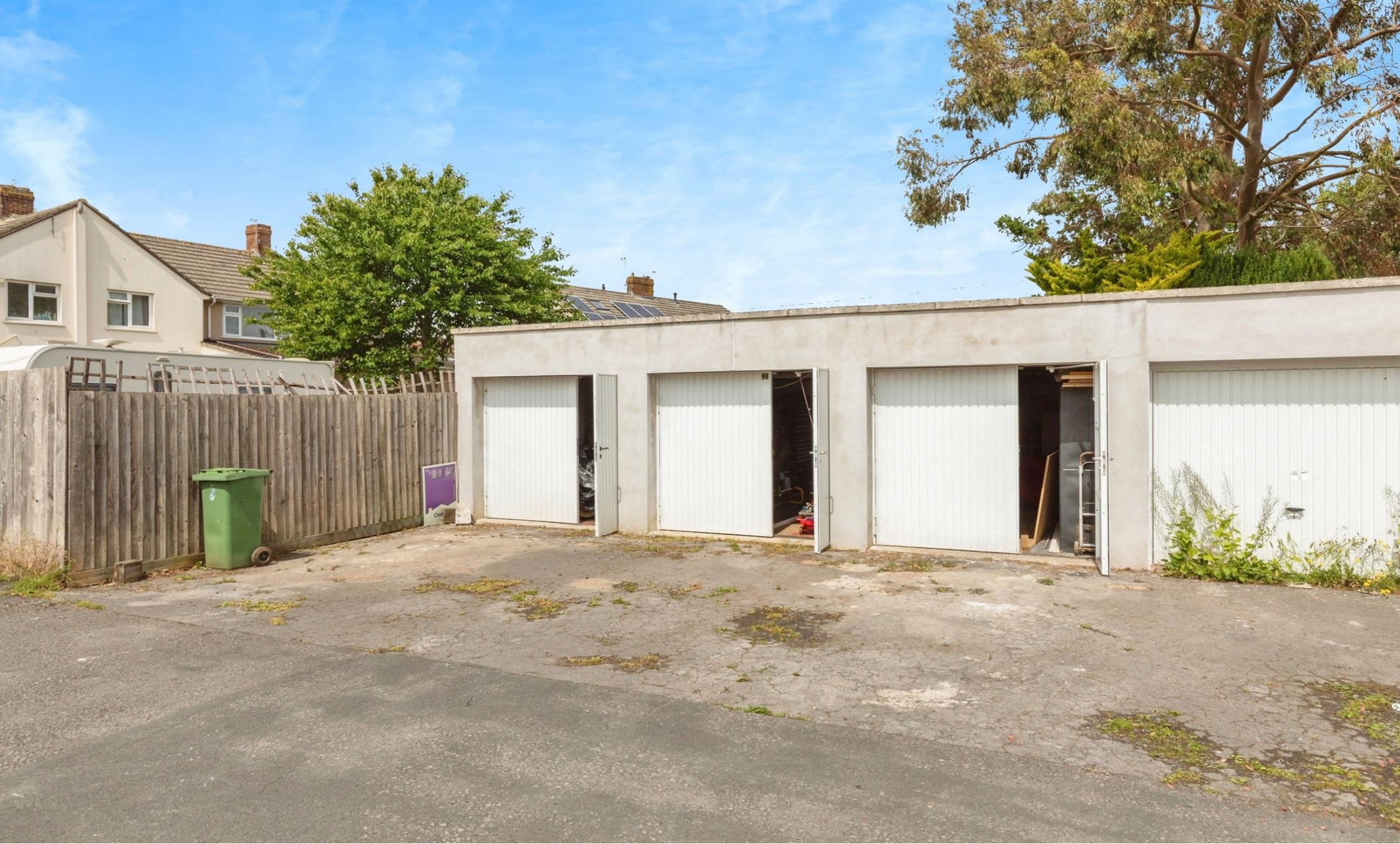
Garage Melrose Avenue, Yate Bristol BS37 7AL