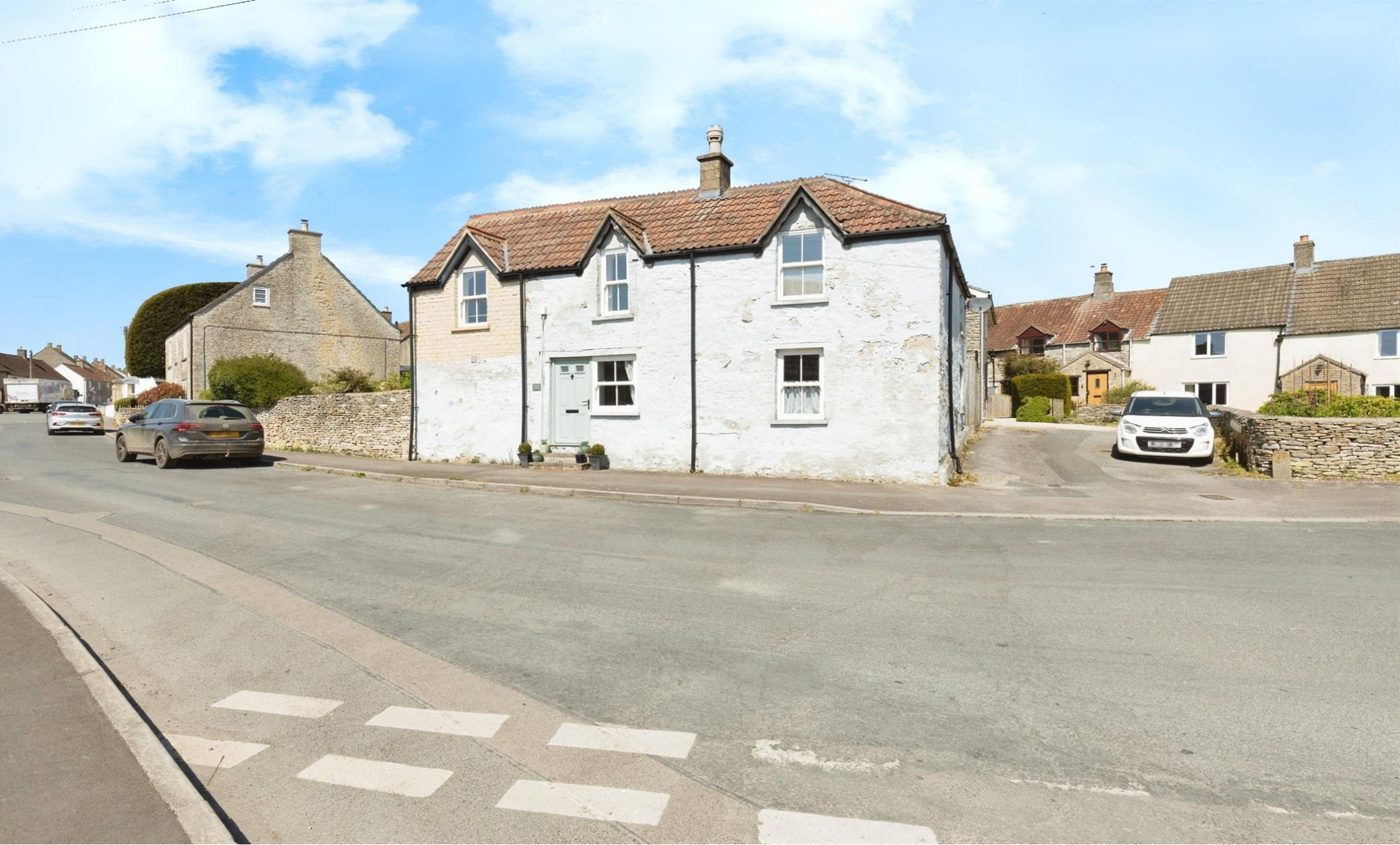
The Plain, Hawkesbury Upton Badminton GL9 1AT