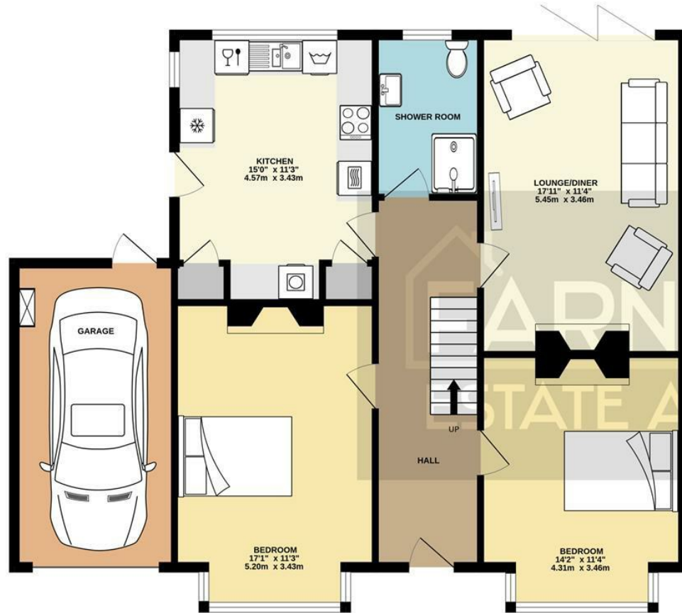
GROUND FLOOR 1013 sq.ft. (94.1 sq.m.) approx.