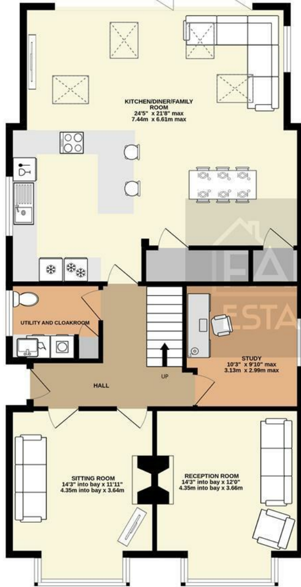
GROUND FLOOR 1070 sq.ft. (99.4 sq.m.) approx.