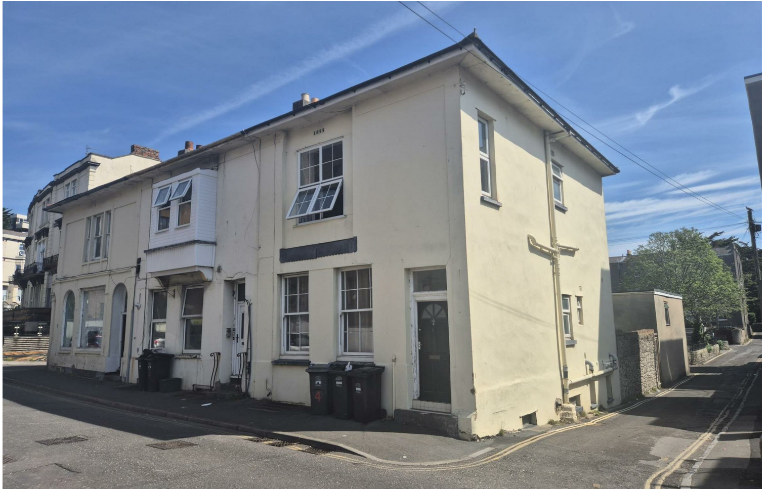
4, UPPER CHURCH ROAD, WESTON-SUPER-MARE, BS23 2DT £400,000