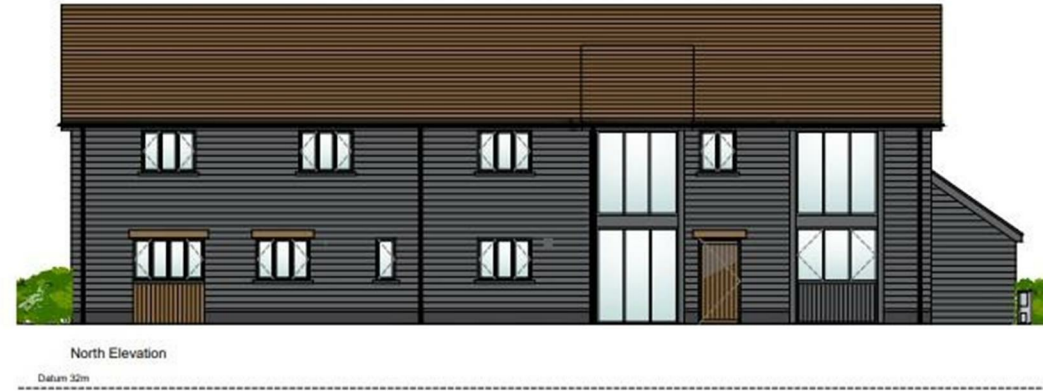
Proposed Plots 6 & 7