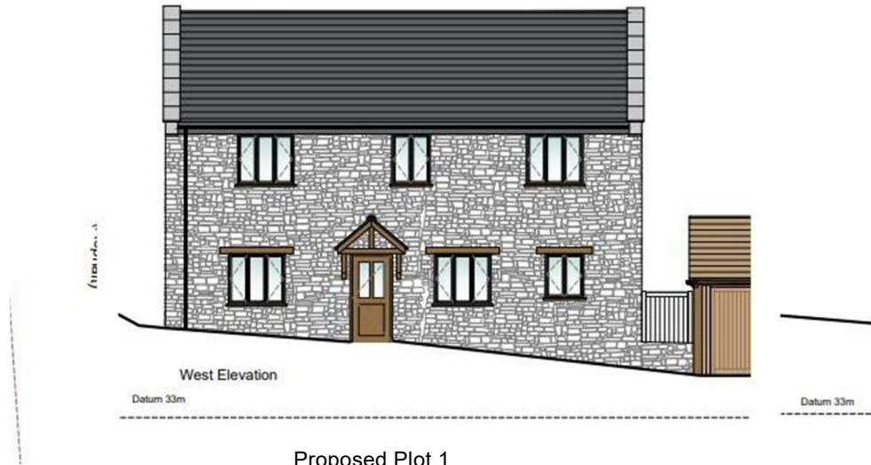
Proposed Plot 1