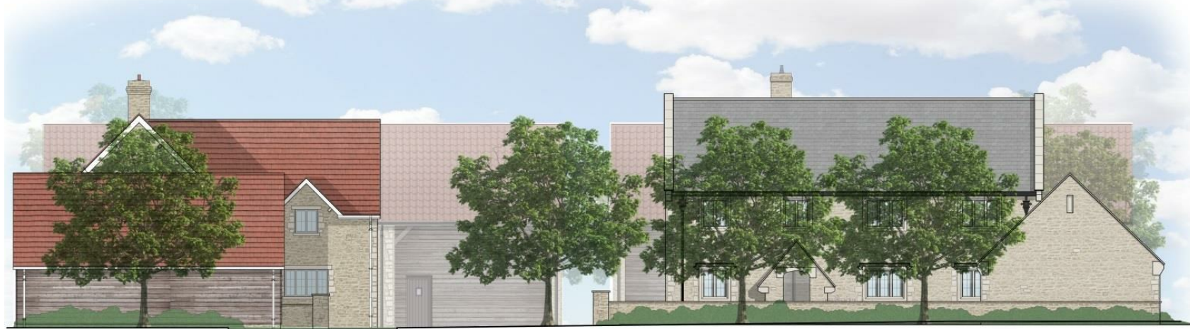
STREET SCENE (proposed) - scale 1/100 0 2m 4m

A residential development site of 0.61 hectares/1.50 acres with proposed accommodation to be 4 No. x four bedroom detached houses,