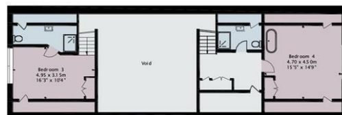
North Barn First Floor

Milton Barnes, Milton, East Knoyle, SP3 6BJ Gross Internal Area (Approx.) West Barn = 96.5 sq m / 1,039 sq ft North Barn = 235 sq m / 2,530 sq ft East Barn = 76.1 sq m / 819 sq ft Internal Area (Excluding Workshop/Garage/Store) = 407.6 sq m / 4,387 sq ft Total Area = 483.4 sq m / 5,203 sq ft