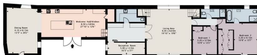
North Barn Ground Floor