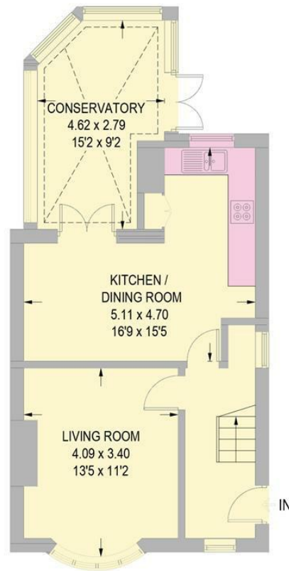
GROUND FLOOR 51.4 SQ M / 553 SQ FT