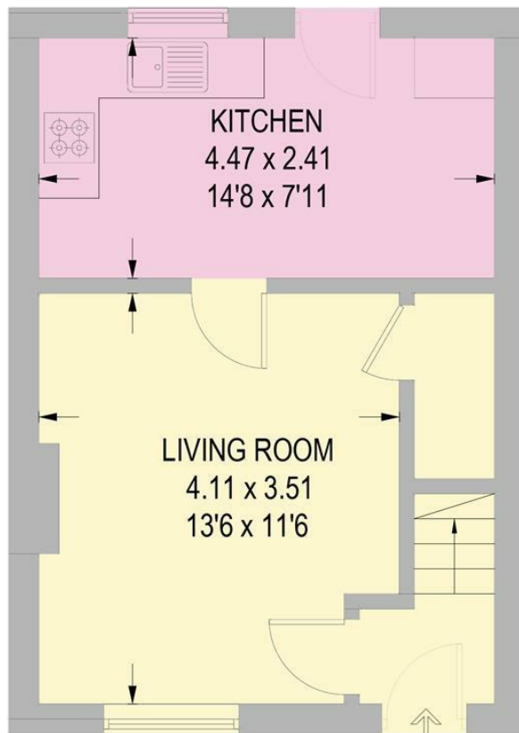
GROUND FLOOR 30.5 SQ M / 328 SQ FT

APPROXIMATE GROSS INTERNAL AREA = 63.7 SQ M / 685 SQ FT