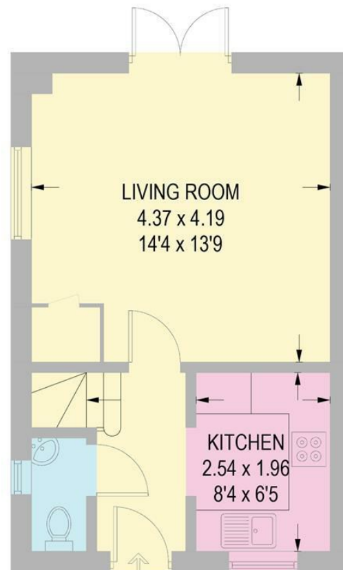
GROUND FLOOR 30.6 SQ M / 329 SQ FT

APPROXIMATE GROSS INTERNAL AREA = 60.8 SQ M / 654 SQ FT