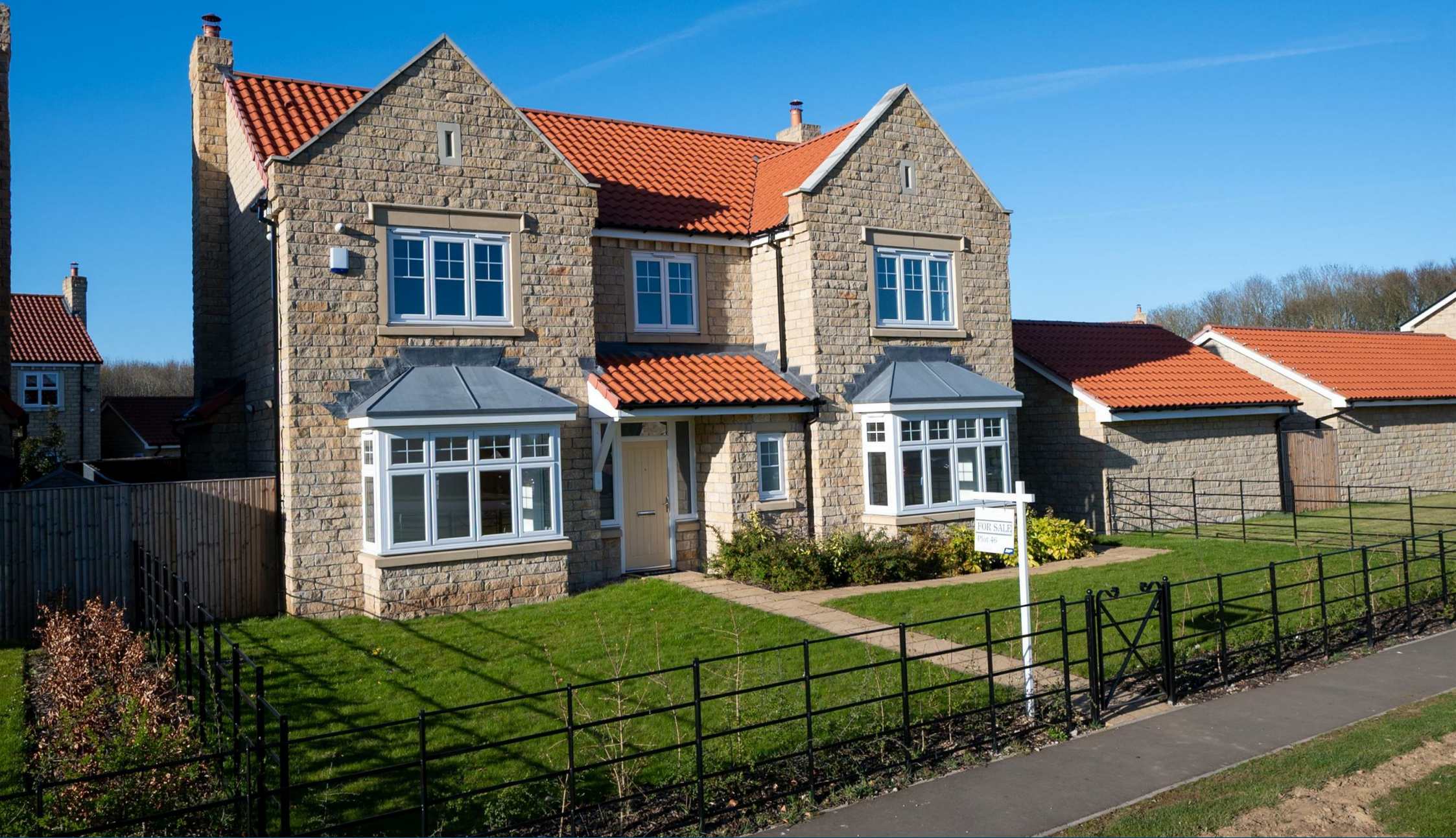
Plot 46 - The Knightsbridge, 42 Settlement Drive, Clowne, Chesterfield,