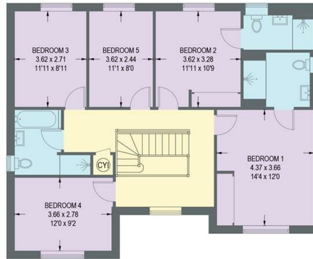
FIRST FLOOR 90.5 SQ M / 974 SQ FT