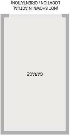
Illustration for identification purposes only. measurements are approximate, not to scale.

While we endeavour to make our sales particulars fair, accurate and reliable, they are only a general guide to the property and, accordingly, if there is any point, which is of particular importance to you, please contact the relevant office. The Agents have not tested any apparatus, equipment, fittings or services and so cannot verify they are in working order. The buyer is advised to obtain verification. Please note all the measurement details are approximate and should not be relied upon as exact. All plans, floor plans and maps are for guidance purposes only and are not to scale. Under no circumstances should they be relied upon as exact or for use in planning carpets and other such fixtures, fittings or furnishings. YOUR HOME IS AT RISK IF YOU DO NOT KEEP UP REPAYMENTS ON A MORTGAGE OR OTHER LOAN SECURED ON IT. A Life Assurance policy may be requested. Written Quotations of credit terms available on request.