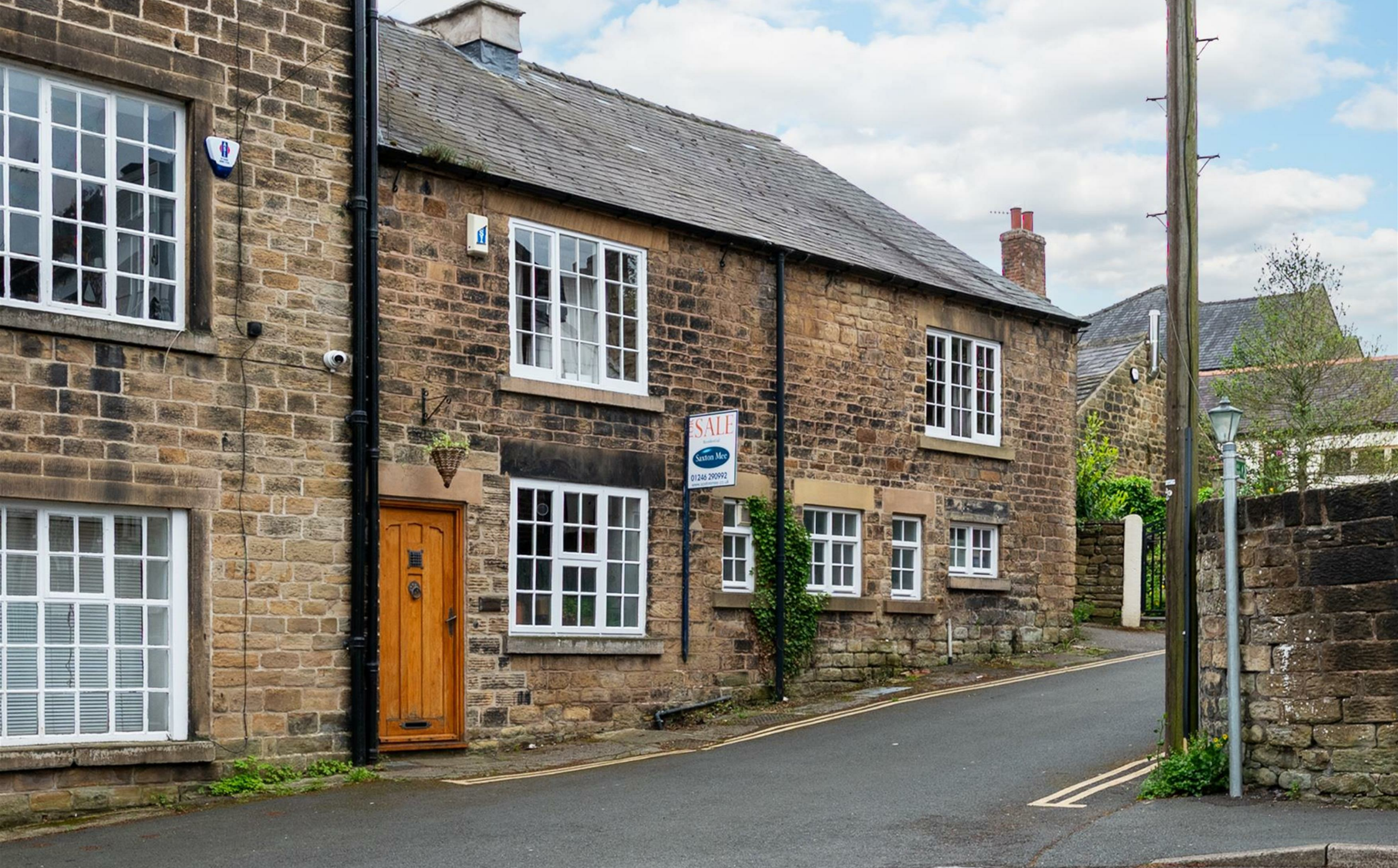
Grange House Church Street, Dronfield, S18 1QB