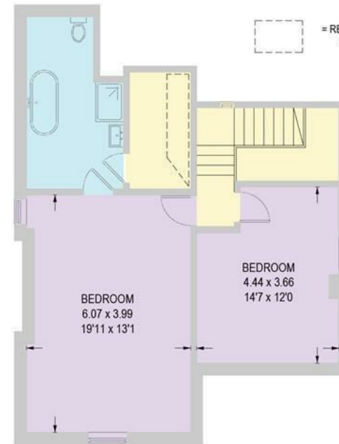
SECOND FLOOR 63.5 SQ M / 683 SQ FT