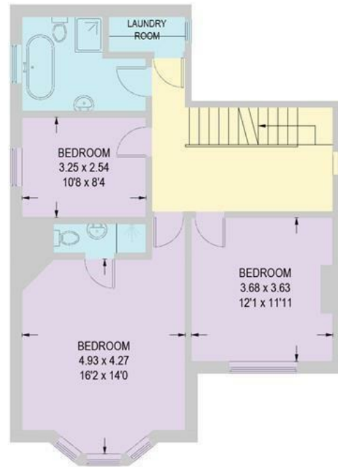
FIRST FLOOR 68.8 SQ M / 741 SQ FT