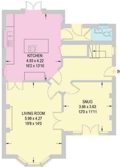
GROUND FLOOR 74.2 SQ M / 799 SQ FT