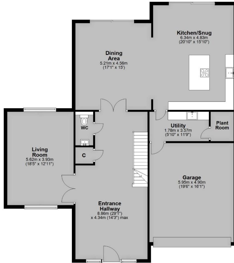
Ground Floor Approx. 156.4 sq. metres (1683.4 sq. feet)