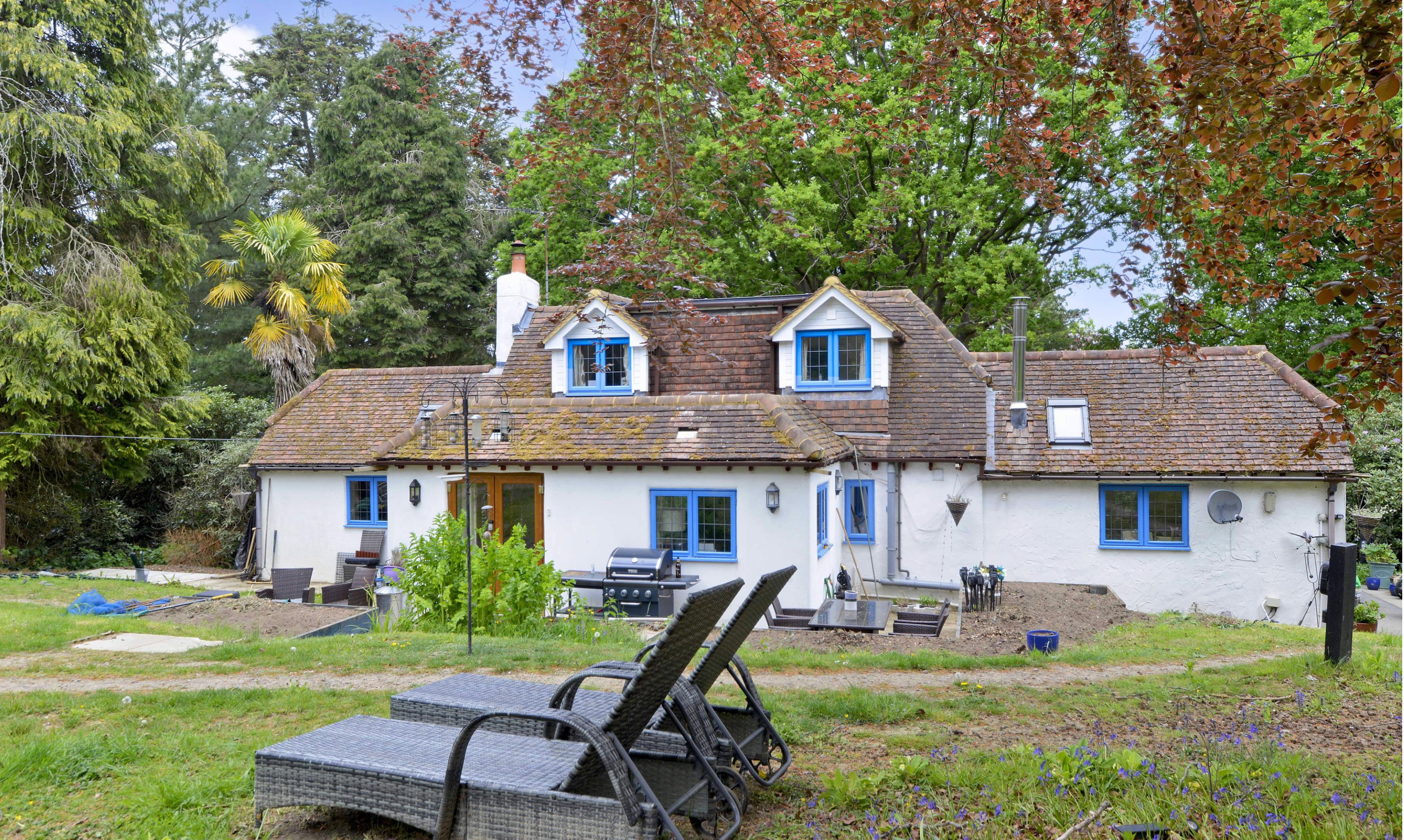
Inglenook Cottage Knowle Lane, Cranleigh, GU6 8UW Asking Price: £950,000 Freehold