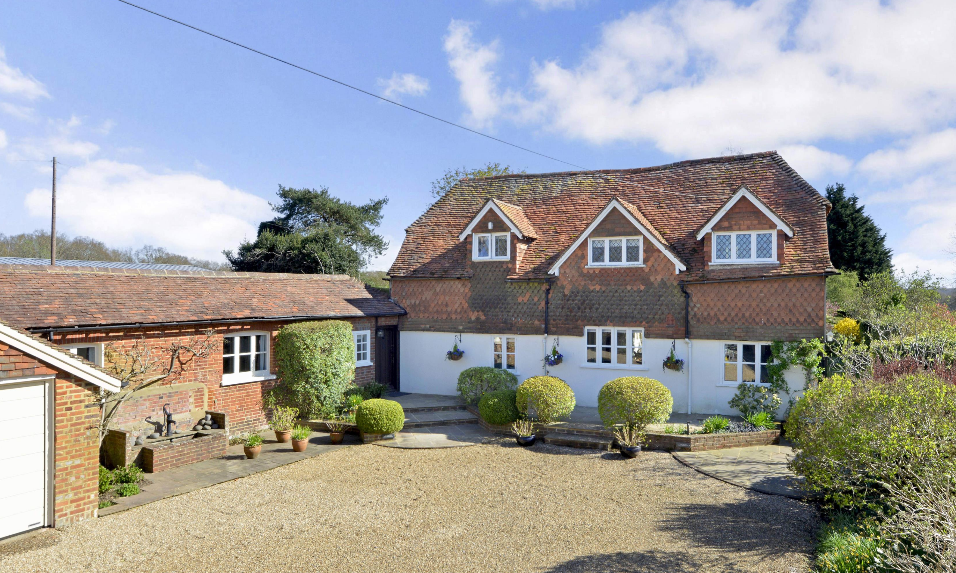
Old Barn Cottage Knowle Lane, Cranleigh