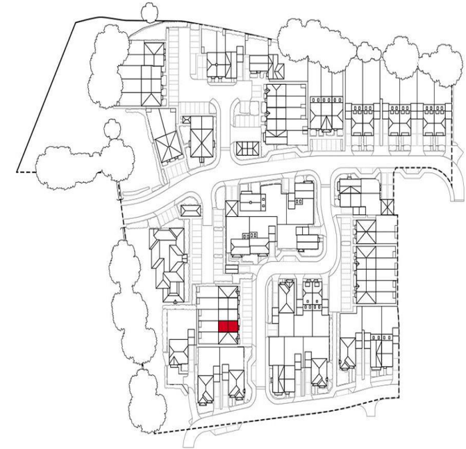
Leighwood Fields, The Maples - The Baxter, Property 226, Site Map