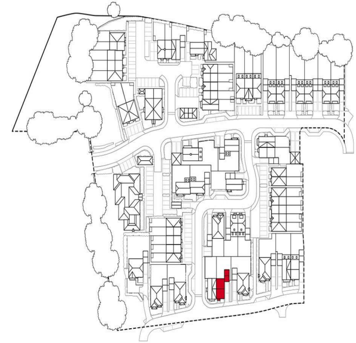
Leighwood Fields, The Maples - The Arber, Property 308, Site Map