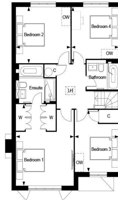
Leighwood Fields, The Maples - The Wells, Property 310, First Floor