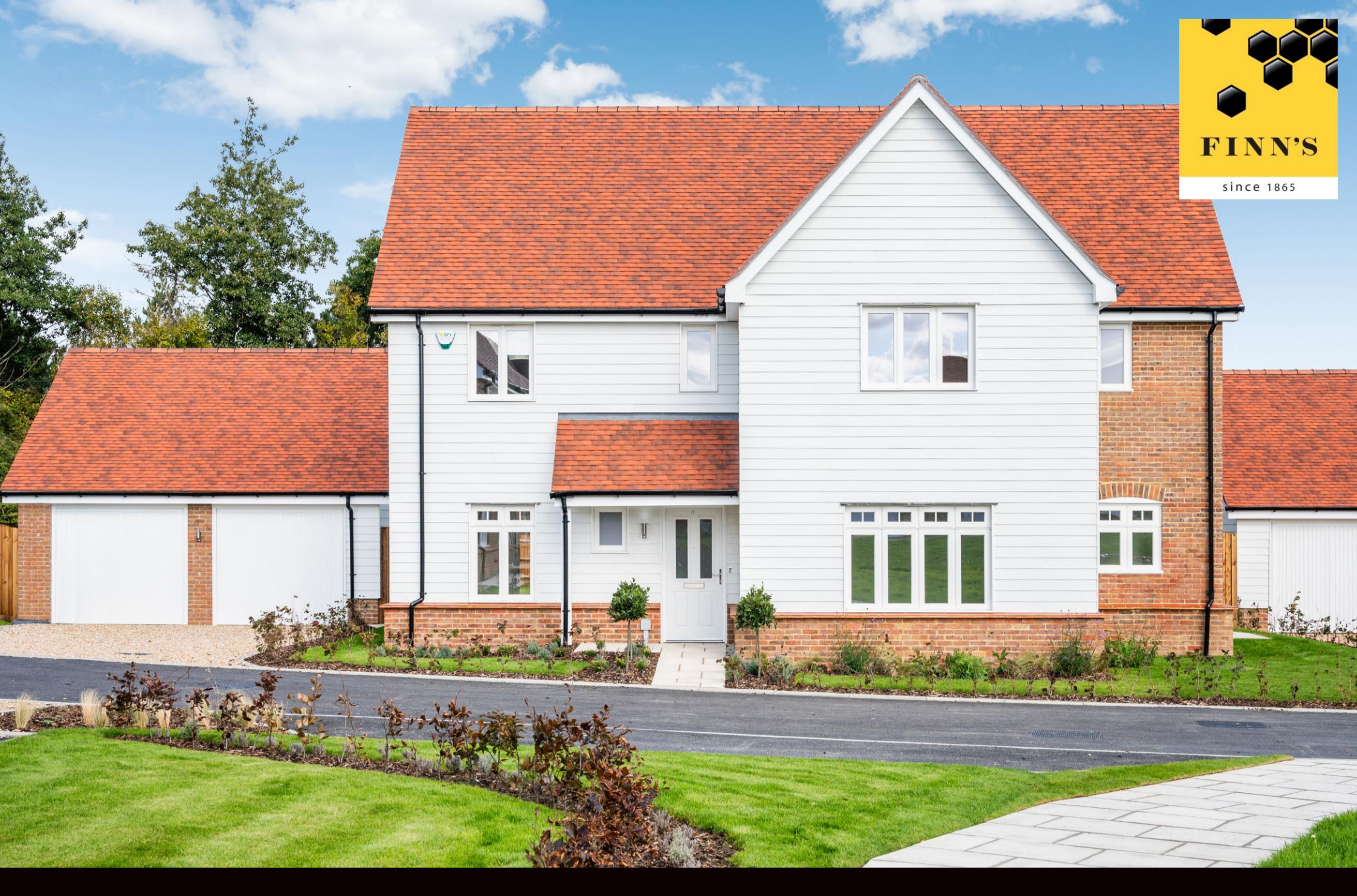
Plot 16, Azalea Cottage, Summerfield Close, Staple, Canterbury, CT3 1LD