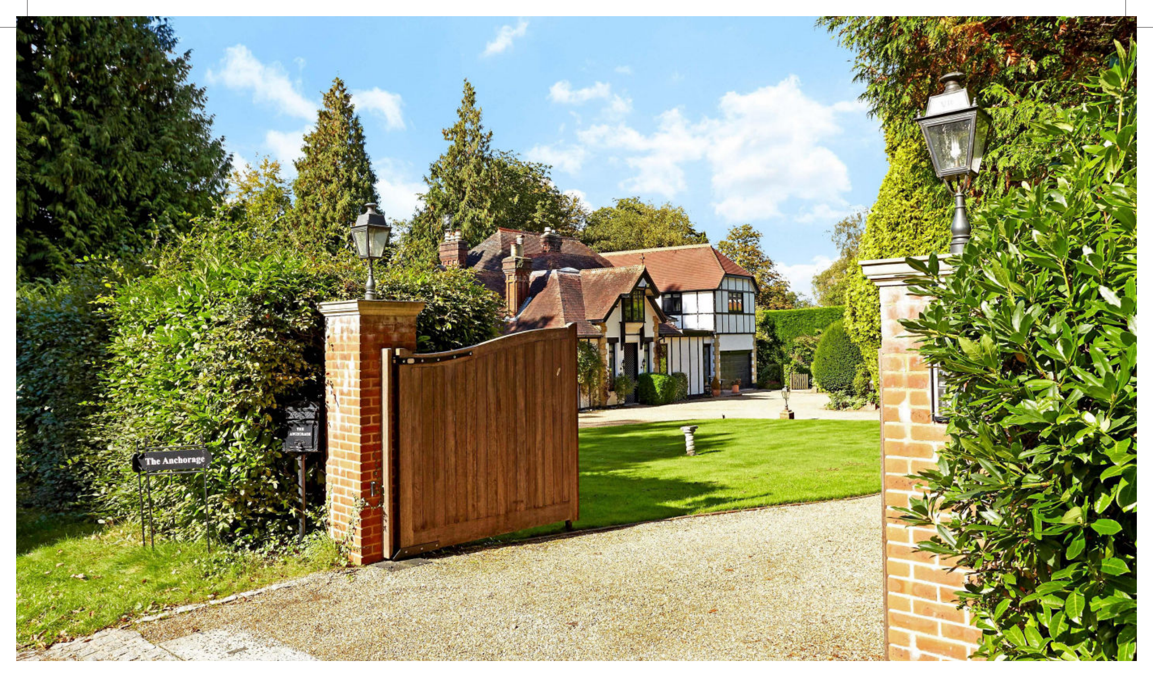
The Anchorage, Dormans Park, Surrey