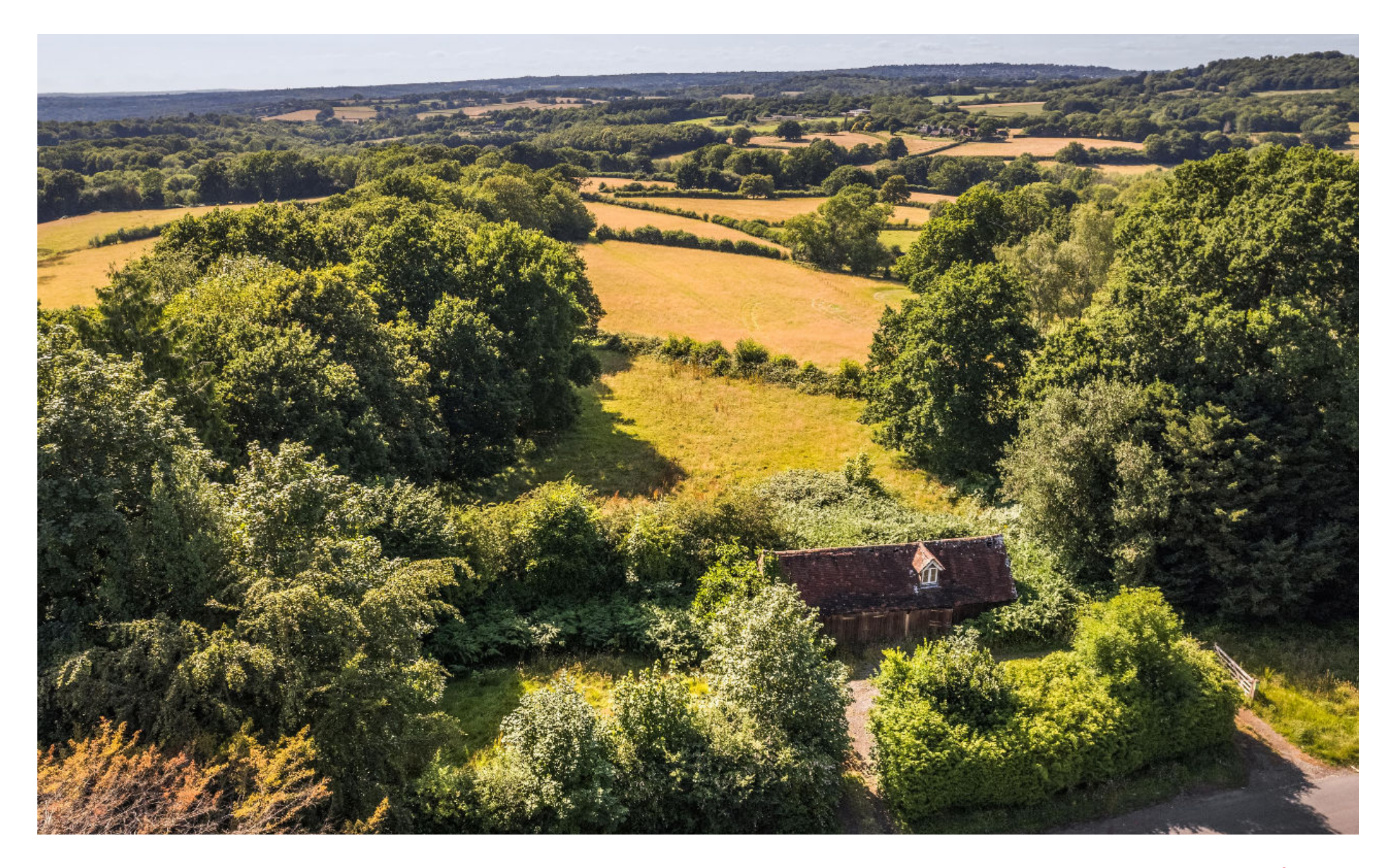
Twitts Gyll Stable, Mayfield, East Sussex