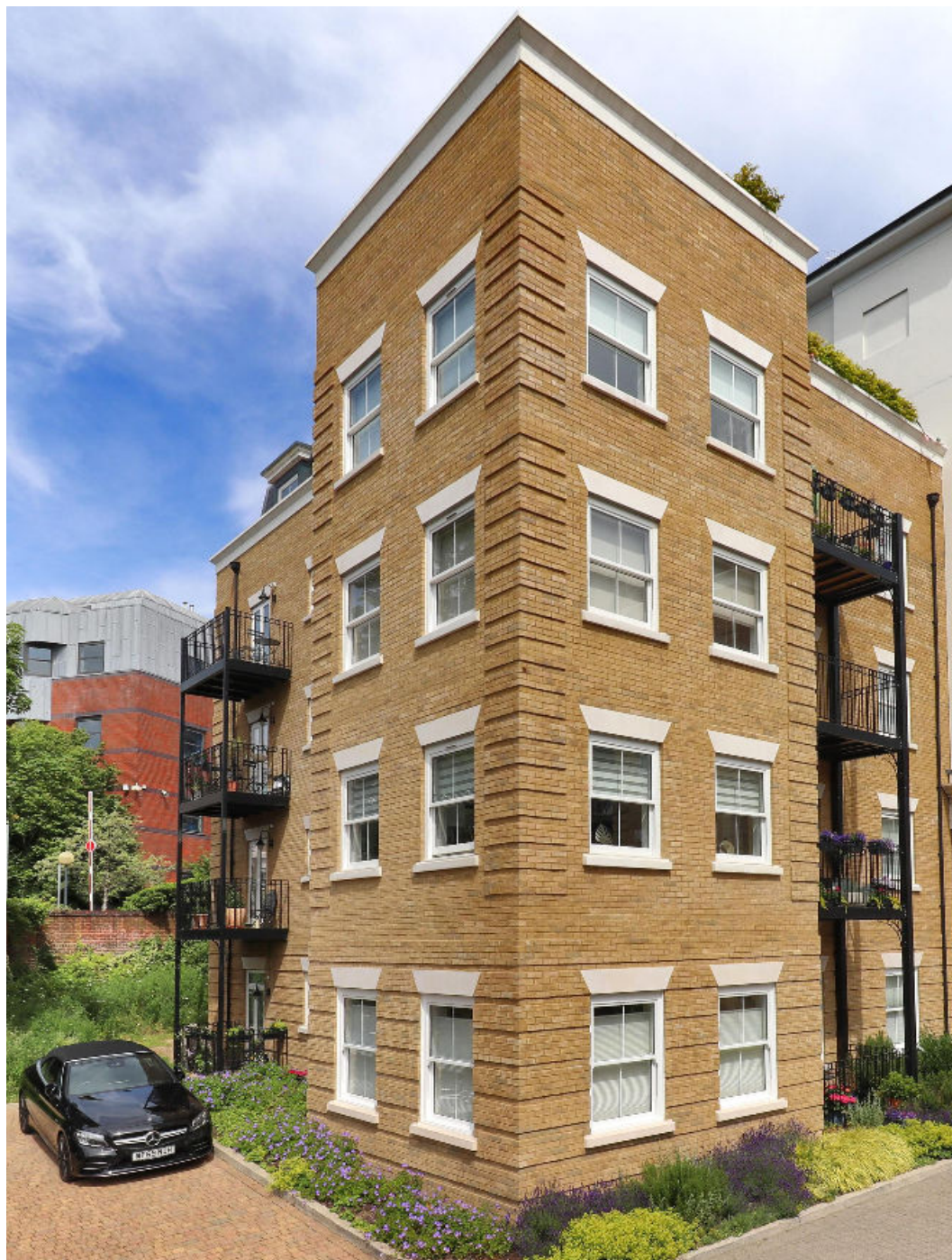
Sapphire House, Sovereign Place, Tunbridge Wells